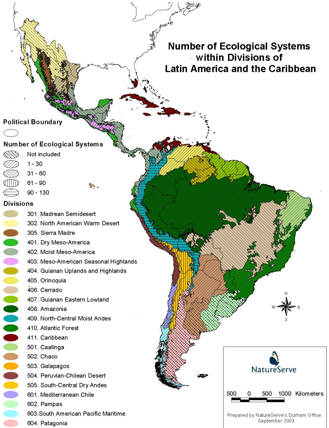
Figure 3. Number of Terrestrial Ecological System types by Ecological Division