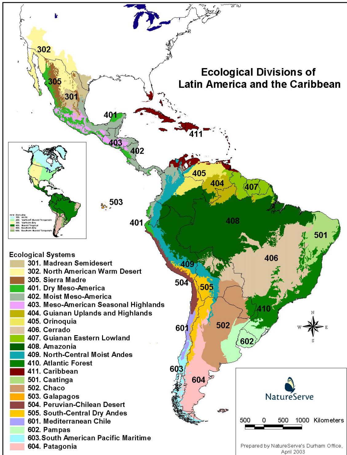
Figure 1. Ecological Divisions of America used in organization and nomenclature of NatureServe Ecological Systems