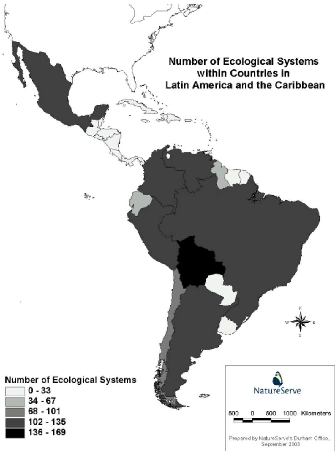
Figure 4. Number of Terrestrial Ecological System types by Country