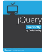
jQuery Succinctly Cody Lindley ( http://www.syncfusion.com/resources/techportal/ebooks/jquery?bookid=513&bookname=BizDev-jQuery.org0513 )